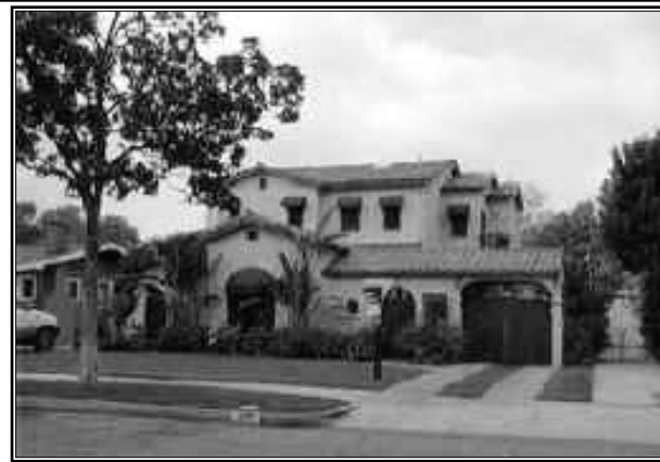
331 S. Ohio