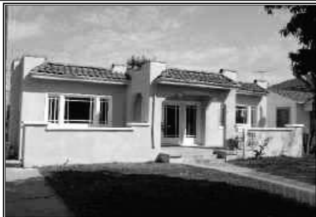
114 S. Illinois St.

"Every House in the Colony is different. Some houses are worth more than others because of their rarity, curb appeal or restoration work"