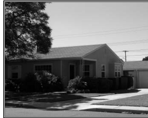
912 W. Alberta

Impeccably kept 3 bedroom, 1 3/4 bath home offers approx 1900 sq. ft., Pecan wood flooring, huge family room, 2 car attached garage, and lush landscaping.