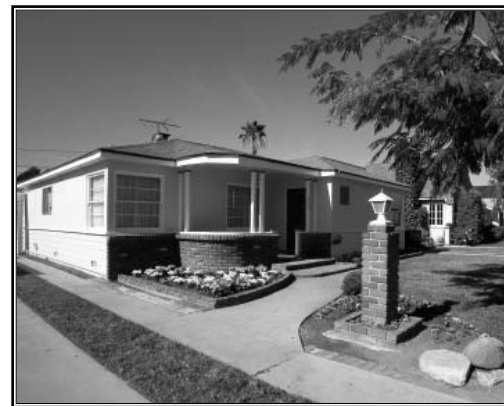
413 N. Janss

Rare 4 bedroom, 2 full bath home is approx. 2000 sq. ft., features adorable front porch, French doors, hardwood floors, bright kitchen, many upgrades!