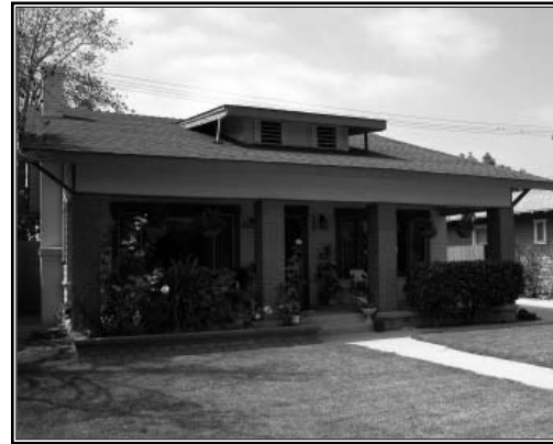
719 N. Zeyn

Classic Craftsman bungalow in the heart of Anaheim, 2 bedrooms, approx. 1137 sq. ft., Douglas fir wainscoting, and large bright kitchen with dishwasher.