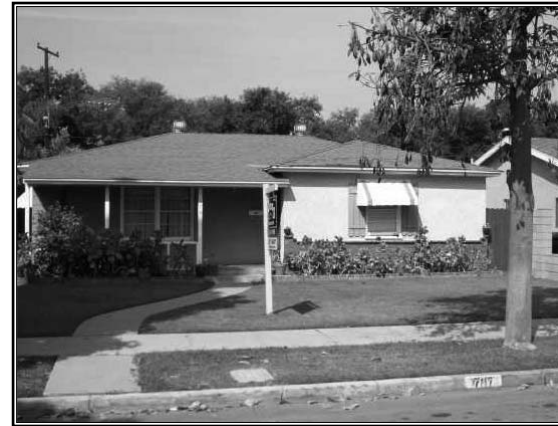
707 S. Philadelphia St.

The average home in "back up" position in Anaheim (92805) has been on the market for 136 days, averages 1,435 square feet, and averages a price of $465,833 and has three bedrooms. The average home in "pending" position in Anaheim (92805) has been on the market for 48 days, averages 1,343 square feet and averages price of $457,738 and has three bedrooms.