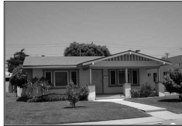
546 S. Lemon St.