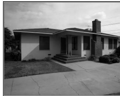
830 W. Ken Way

This home has it all, location, aggressive price, and fabulous condition! Front porch, large living room, bright kitchen, 3 bedrooms, hardwood floors, and more!