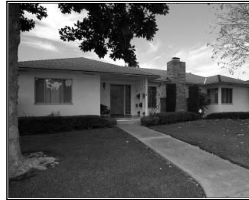
415 W. Alberta

4 bedroom, U-shaped Ranch style home, enormous windows with views of park-like backyard, approx. 2100 sq. ft., fireplace, and formal dining room with wainscoting.